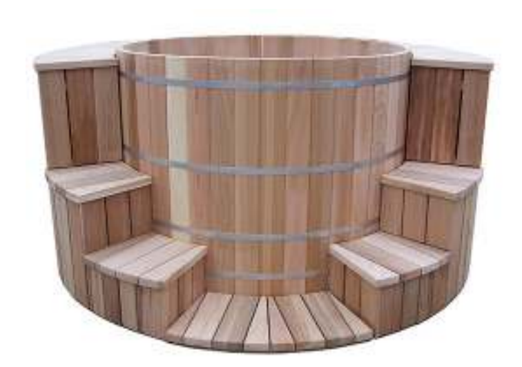
6' diameter x 4' high Cedar Tub Pictured with optional Tub Surround Package.